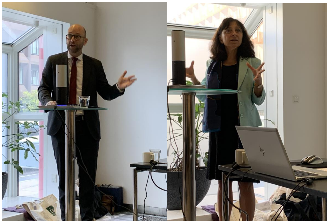
In full flow at the General Assembly: